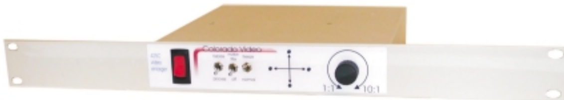
Model 425C with optional Rack Mount

Signals from analog video tape recorders or line-lock cameras must be time base corrected to ensure proper operation of these units.